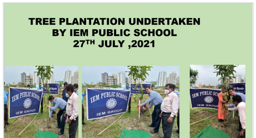
Tree Plantation on 27 th July 2021