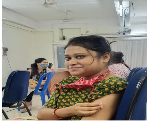
Teacher's Vaccination Day at IEM